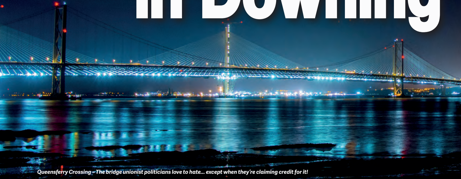
Queensferry Crossing – The bridge unionist politicians love to hate... except when they're claiming credit for it!