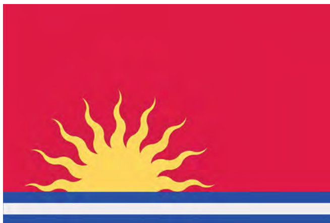
Flag of the Company of Scotland Trading to Africa and the Indies (1698).

end of Darien, but the Company of Scotland persisted with its efforts to establish trading links elsewhere bringing it into constant conflict with the English. By this time, Queen Anne had ascended to the throne and was anxious to avoid war with Scotland, which was a distinct possibility as the continuous English interference in Scottish trading activities had, understandably, not been appreciated by either the Scottish Parliament or the Scottish public. Her solution was to instigate negotiations with the Scottish nobility with a view to uniting the parliaments of Scotland and England. Why would the Scots be interested in giving up their political independence? Well, as always, follow the money...!