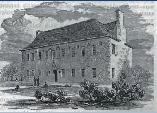
Company of Scotland HQ – Darien House, Edinburgh (now demolished)

As part of the Treaty of Union negotiations in 1707, the English Parliament offered the sum of £398,085 (and 10 shillings!) to, effectively, reimburse those individuals who had lost their investment in the Company of Scotland. As the principal investors were drawn from the ranks of the same nobility negotiating the treaty... hence we see with absolute clarity the targets of the famous Burns' line, "We're bought and sold for English gold, sic a parcel o' rogues in a nation"!