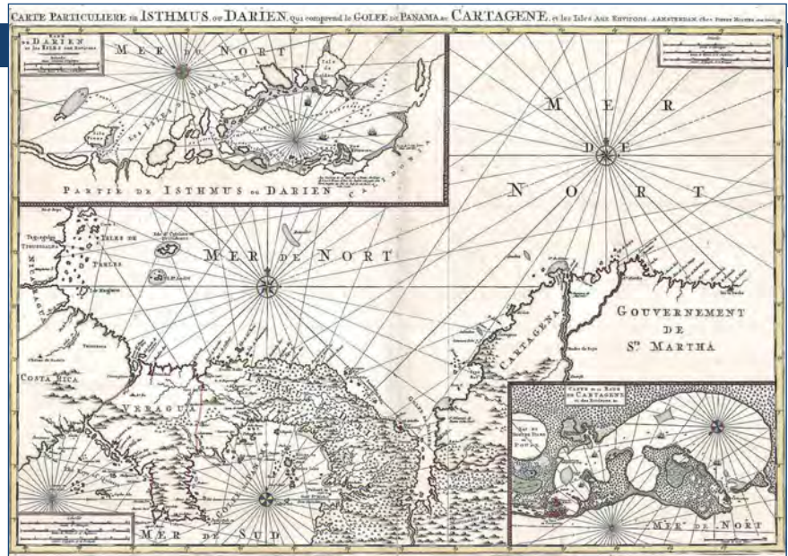
The colony of Scotland (1698–1700) was situated on the isthmus of Panama on the Gulf of Darién. The aim was to have a route connecting the Pacific and the Atlantic to enable trade. It was abandoned after a siege by Spain in 1700.

That the ventures failed in large part due to the sleekit subterfuge of the English Establishment, supported and