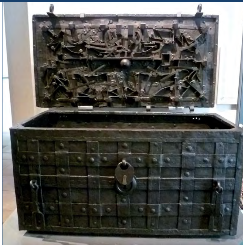
This chest was used to store the money and documents of the Company of Scotland, established in 1695

Spain wasn't best pleased with the whole venture either, as they had their own claims to the territory, and blockaded Fort St Andrew in an effort to drive the Scots out, which they finally achieved in 1700. That was the